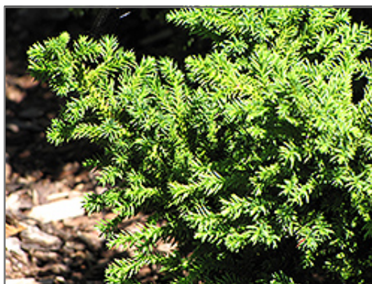
Lobbii Dwarf Japanese Cedar foliage