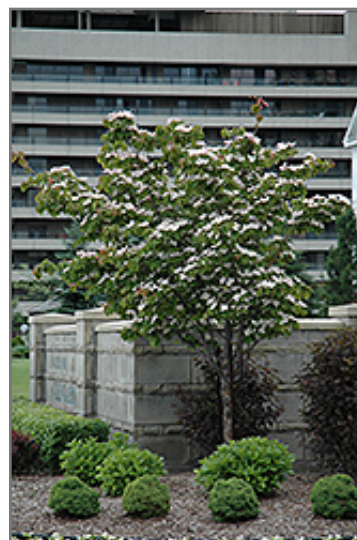
Flowering Dogwood in bloom