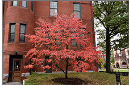
Flowering Dogwood in fall

This plant is not reliably hardy in our region, and certain restrictions may apply; contact the store for more information.