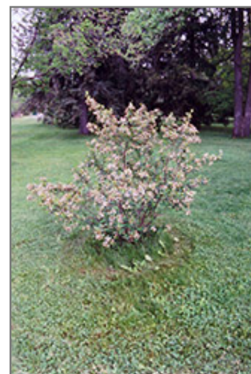
Black Chokeberry in bloom