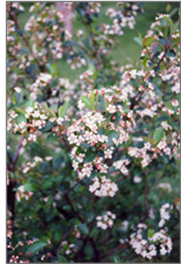
Black Chokeberry flowers

This shrub should only be grown in full sunlight. It is an amazingly adaptable plant, tolerating both dry conditions and even some standing water. It is not particular as to soil type or pH, and is able to handle environmental salt. It is somewhat tolerant of urban pollution. This species is native to parts of North America.