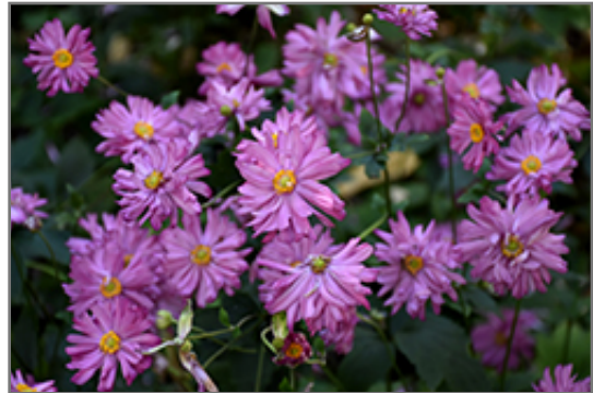
Prince Henry Anemone flowers