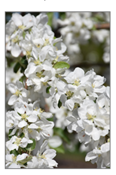
Norkent Apple flowers