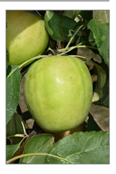
Norkent Apple fruit

Norkent Apple features showy clusters of lightly-scented white flowers with shell pink overtones along the branches in mid spring, which emerge from distinctive pink flower buds. It has forest green deciduous foliage. The pointy leaves turn yellow in fall. The fruits are showy light green apples with scarlet stripes, which are carried in abundance in late summer. The fruit can be messy if allowed to drop on the lawn or walkways, and may require occasional clean-up.