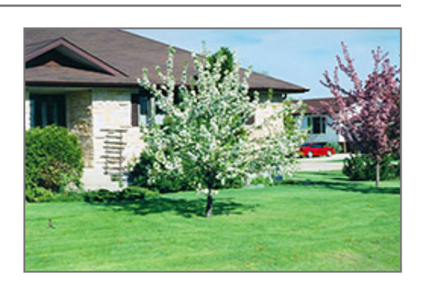
Norkent Apple in bloom

This tree is typically grown in a designated area of the yard because of its mature size and spread. It should only be grown in full sunlight. It prefers to grow in average to moist conditions, and shouldn't be allowed to dry out. It is not particular as to soil type or pH. It is highly tolerant of urban pollution and will even thrive in inner city environments. This particular variety is an interspecific hybrid.