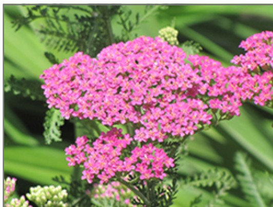
Pretty Belinda Yarrow flowers

Pretty Belinda Yarrow is recommended for the following landscape applications;