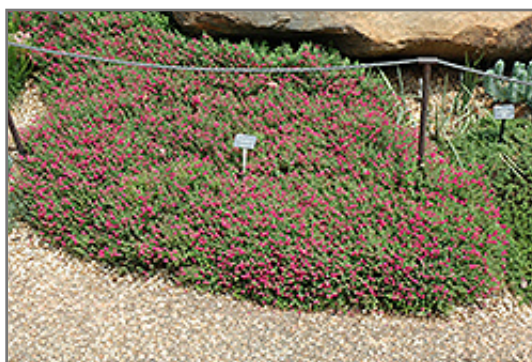
Texas Rose Pink Skullcap in bloom