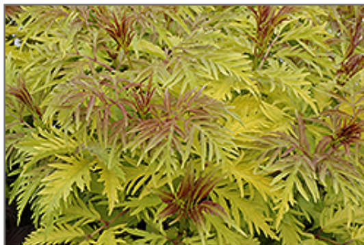
Golden Glow Elder foliage

Golden Glow Elder will grow to be about 5 feet tall at maturity, with a spread of 5 feet. It has a low canopy, and is suitable for planting under power lines. It grows at a fast rate, and under ideal conditions can be expected to live for approximately 30 years.