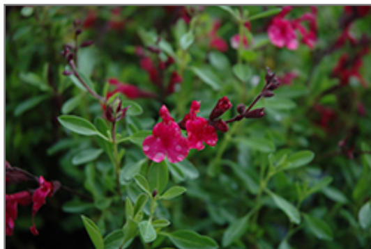
Furman's Red Texas Sage flowers

Furman's Red Texas Sage is recommended for the following landscape applications;