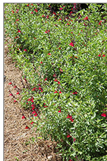
Furman's Red Texas Sage in bloom