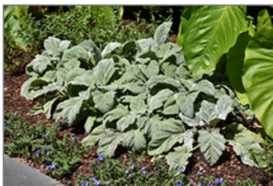
Silver Sage