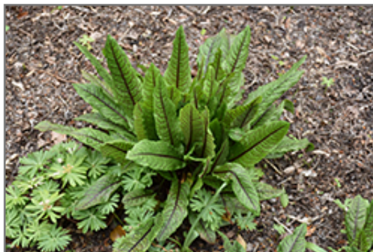
Ornamental Sorrel