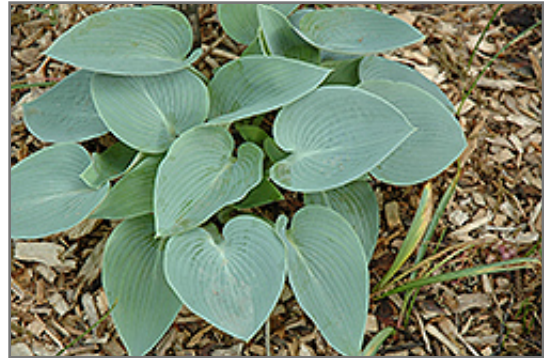
Powderpuff Hosta foliage