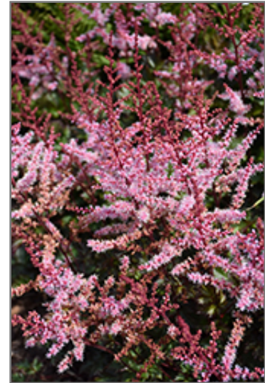
Delft Lace Astilbe flowers

This is a relatively low maintenance plant, and is best cleaned up in early spring before it resumes active growth for the season. It is a good choice for attracting butterflies to your yard, but is not particularly attractive to deer who tend to leave it alone in favor of tastier treats. It has no significant negative characteristics.