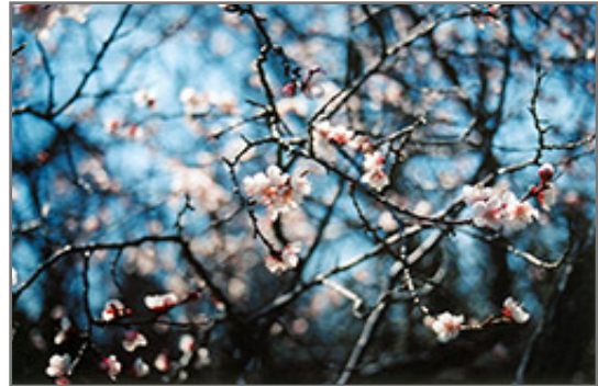
M604 Apricot flowers

M604 Apricot is blanketed in stunning clusters of fragrant shell pink flowers along the branches in early spring, which emerge from distinctive pink flower buds before the leaves. It has green deciduous foliage. The pointy leaves turn yellow in fall. The fruits are showy yellow drupes with gold overtones, which are carried in abundance in late summer. The fruit can be messy if allowed to drop on the lawn or walkways, and may require occasional clean-up.