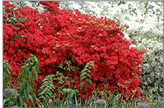
Stewartstonian Azalea in bloom