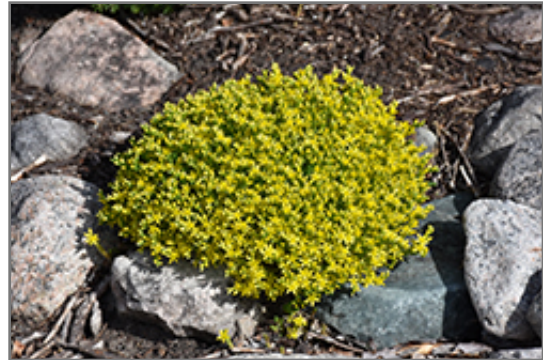
Golden Moss Stonecrop in bloom

Golden Moss Stonecrop is recommended for the following landscape applications;