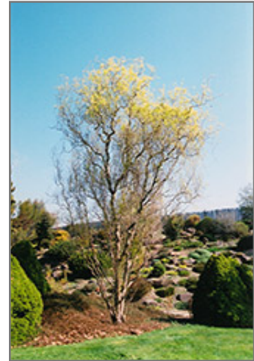
Dragon's Claw Willow in winter