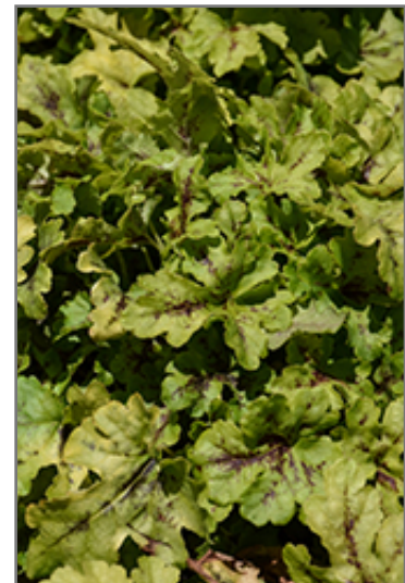
Spicy Lime Foamy Bells foliage