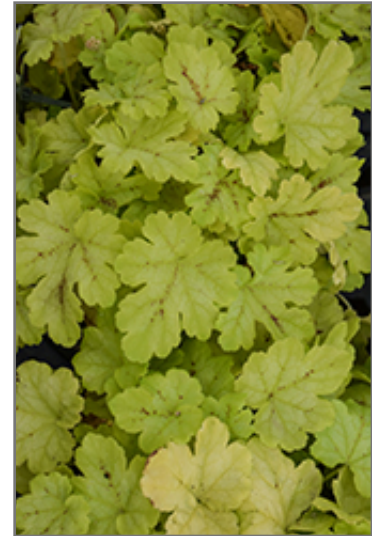
Spicy Lime Foamy Bells foliage

Spicy Lime Foamy Bells is recommended for the following landscape applications;