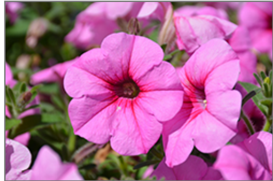
Durabloom Royal Pink Petunia flowers

Durabloom Royal Pink Petunia is recommended for the following landscape applications;