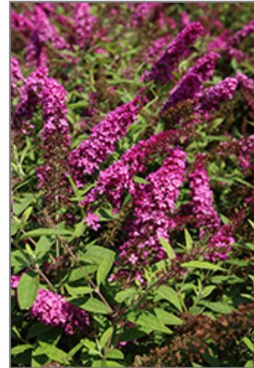
Lo & Behold Ruby Chip Butterfly Bush flowers

Lo & Behold Ruby Chip Butterfly Bush is a multi-stemmed deciduous shrub with a mounded form. Its average texture blends into the landscape, but can be balanced by one or two finer or coarser trees or shrubs for an effective composition.