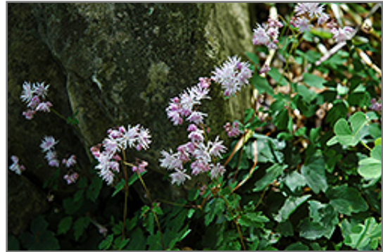
Dwarf Korean Meadow Rue flowers