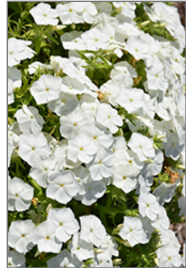
Gisele White Phlox flowers

This plant will require occasional maintenance and upkeep. Trim off the flower heads after they fade and die to encourage more blooms late into the season. It is a good choice for attracting butterflies and hummingbirds to your yard, but is not particularly attractive to deer who tend to leave it alone in favor of tastier treats. It has no significant negative characteristics.