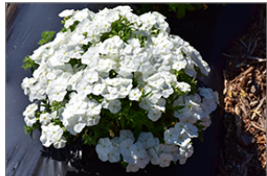
Gisele White Phlox in bloom