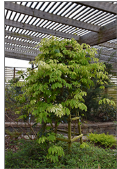
Cartwheel Variegated Stauntonia Vine