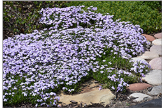
Spring Lavender Moss Phlox in bloom

This plant will require occasional maintenance and upkeep, and should only be pruned after flowering to avoid removing any of the current season's flowers. Deer don't particularly care for this plant and will usually leave it alone in favor of tastier treats. Gardeners should be aware of the following characteristic(s) that may warrant special consideration;