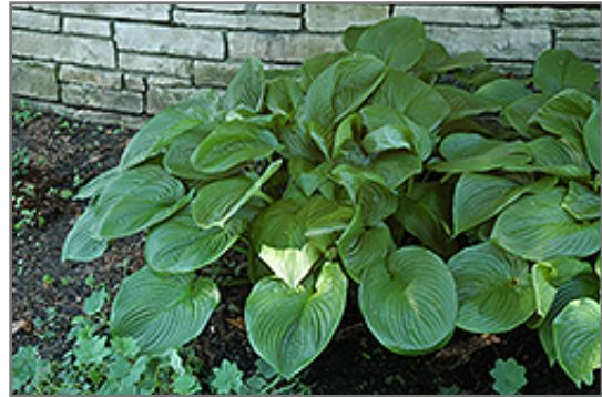
Satin Beauty Hosta

Satin Beauty Hosta is recommended for the following landscape applications;