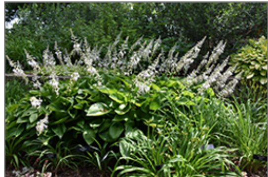
Satin Beauty Hosta in bloom