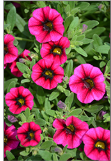
Kimono Black Dragon Calibrachoa flowers

Kimono Black Dragon Calibrachoa is recommended for the following landscape applications;