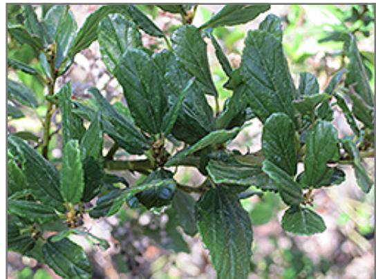
Ramona Lilac foliage