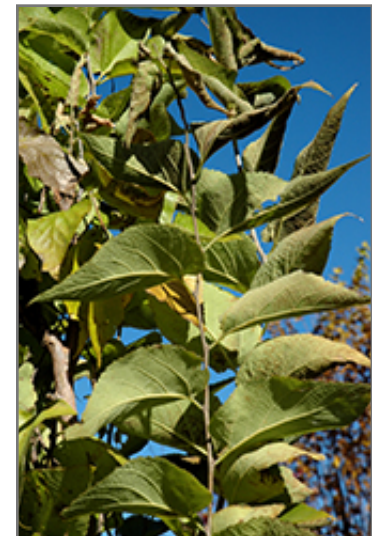
Prairie Sentinel Hackberry foliage