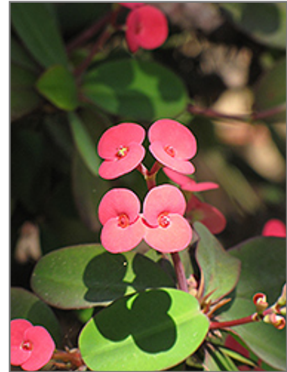
Crown Of Thorns flowers

Crown Of Thorns is recommended for the following landscape applications;