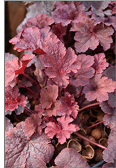
Cajun Fire Coral Bells foliage

Cajun Fire Coral Bells is recommended for the following landscape applications;