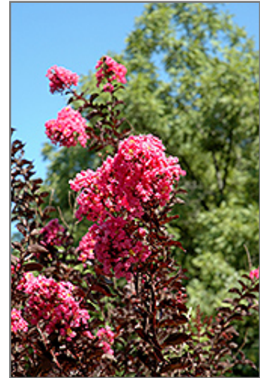
Delta Jazz Crapemyrtle flowers