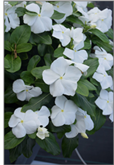
Titan Pure White Vinca flowers

Titan Pure White Vinca is recommended for the following landscape applications;