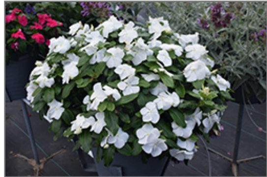
Titan Pure White Vinca in bloom

Titan Pure White Vinca will grow to be about 14 inches tall at maturity, with a spread of 12 inches. Its foliage tends to remain dense right to the ground, not requiring facer plants in front. Although it's not a true annual, this fast-growing plant can be expected to behave as an annual in our climate if left outdoors over the winter, usually needing replacement the following year. As such, gardeners should take into consideration that it will perform differently than it would in its native habitat.