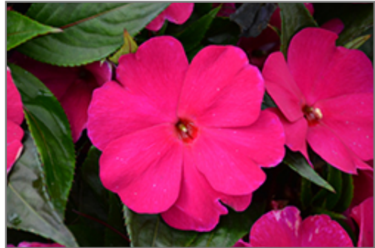
Magnum Purple New Guinea Impatiens flowers

Magnum Purple New Guinea Impatiens is recommended for the following landscape applications;