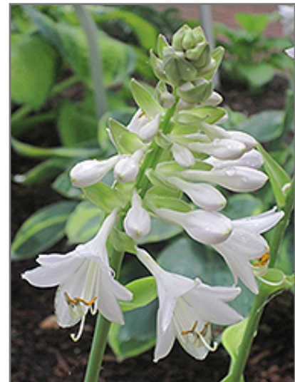
King Tut Hosta flowers