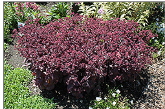
Xenox Stonecrop in bloom