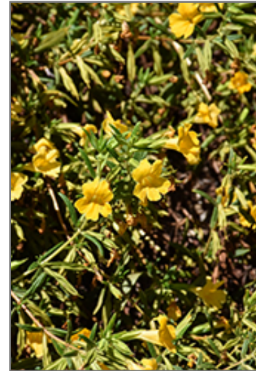
Bush Monkey Flower flowers

Bush Monkey Flower makes a fine choice for the outdoor landscape, but it is also well-suited for use in outdoor pots and containers. Because of its spreading habit of growth, it is ideally suited for use as a 'spiller' in the 'spiller-thriller-filler' container combination; plant it near the edges where it can spill gracefully over the pot. It is even sizeable enough that it can be grown alone in a suitable container. Note that when grown in a container, it may not perform exactly as indicated on the tag - this is to be expected. Also note that when growing plants in outdoor containers and baskets, they may require more frequent waterings than they would in the yard or garden.