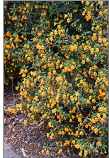
Bush Monkey Flower in bloom

Bush Monkey Flower is recommended for the following landscape applications;