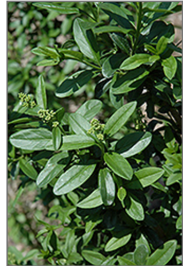
California Privet foliage