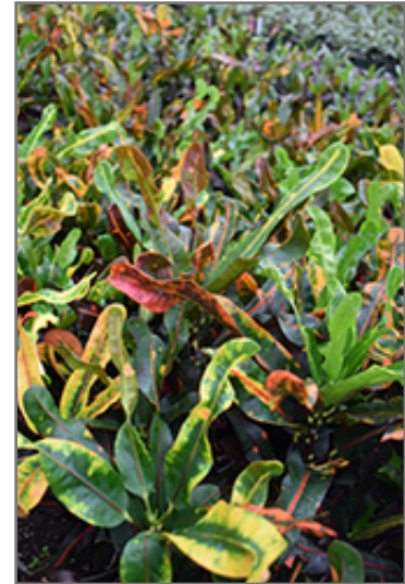
Mammy Croton in full

This is a dense herbaceous evergreen houseplant with an upright spreading habit of growth. Its wonderfully bold, coarse texture is quite ornamental and should be used to full effect. This plant should not require much pruning, except when necessary to keep it looking its best.