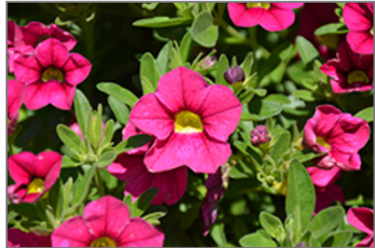
Calitastic Fancy Fuchsia Calibrachoa flowers

Calitastic Fancy Fuchsia Calibrachoa is recommended for the following landscape applications;