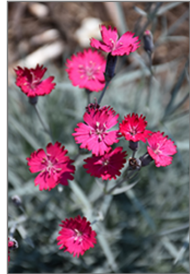
Wicked Witch Pinks flowers

Wicked Witch Pinks is recommended for the following landscape applications;