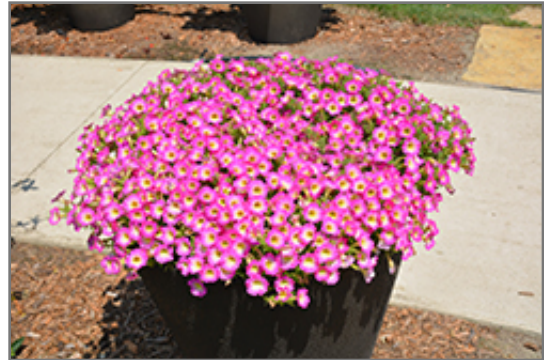
Supertunia Daybreak Charm Petunia in bloom