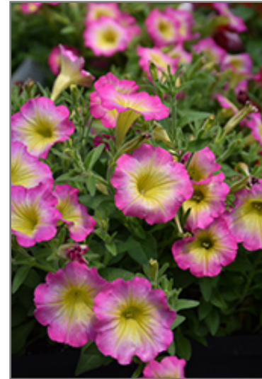
Supertunia Daybreak Charm Petunia flowers

Supertunia Daybreak Charm Petunia is a dense herbaceous annual with a trailing habit of growth, eventually spilling over the edges of hanging baskets and containers. Its medium texture blends into the garden, but can always be balanced by a couple of finer or coarser plants for an effective composition.