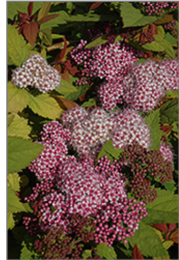
Double Play Big Bang Spirea flowers

Double Play Big Bang Spirea is recommended for the following landscape applications;