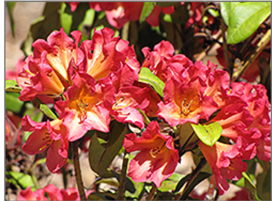
Sonata Rhododendron flowers