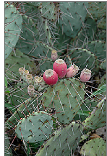
Plains Prickly Pear Cactus fruit