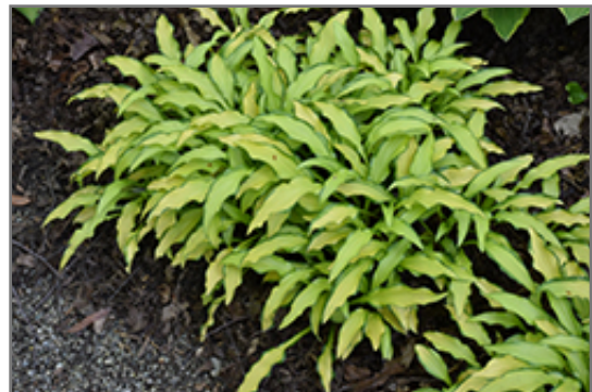
Kabitan Hosta