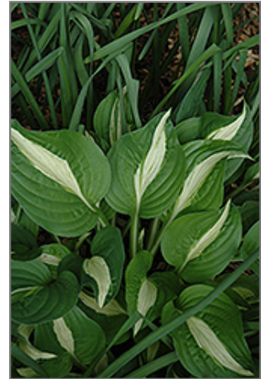
White Bikini Hosta foliage