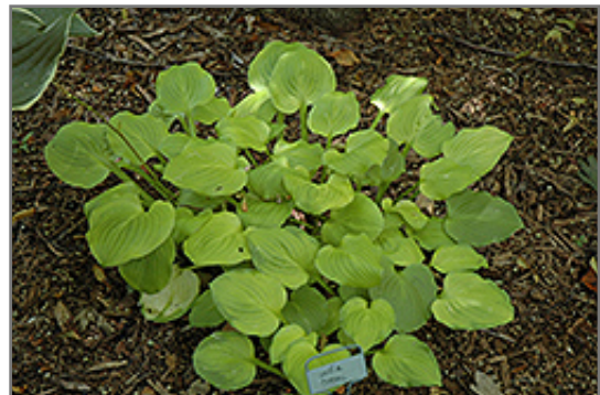
Vanilla Cream Hosta