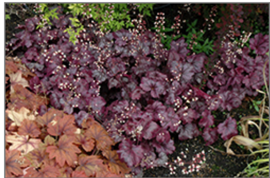
Plum Royale Coral Bells in bloom