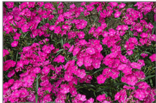
Bouquet Purple Pinks in bloom