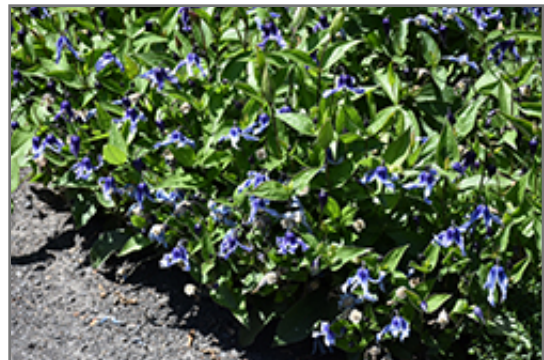
Caerulea Solitary Clematis in bloom